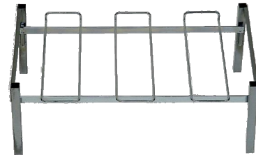
PREMIER ONE RACK (3 BIBS) ADD-ON TO PREMIER RACK 1 IC Code: 44238 Dimensions: 28"W x 16"D x 14.25"H