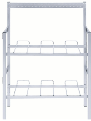
PREMIER RACK 1 (6 BIBS) CAN BE STACKED TO HOLD 12 BIBS IC Code: 44239 Dimensions: 28"W x 16"D x 37"H