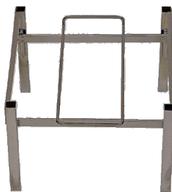
CAMEO ONE RACK IC Code: 44236 Dimensions: 15.5"W x 16"D x 10.25"H