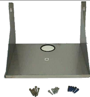
CARB SHELF I.C. Code: 43536 Dimensions: 15.25"W x 13.25"D x 11.25"H