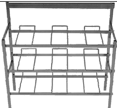
SUPREME RACK (9 BIBS) IC Code: 44243 Dimensions: 41"W x 16"D x 39.25"H